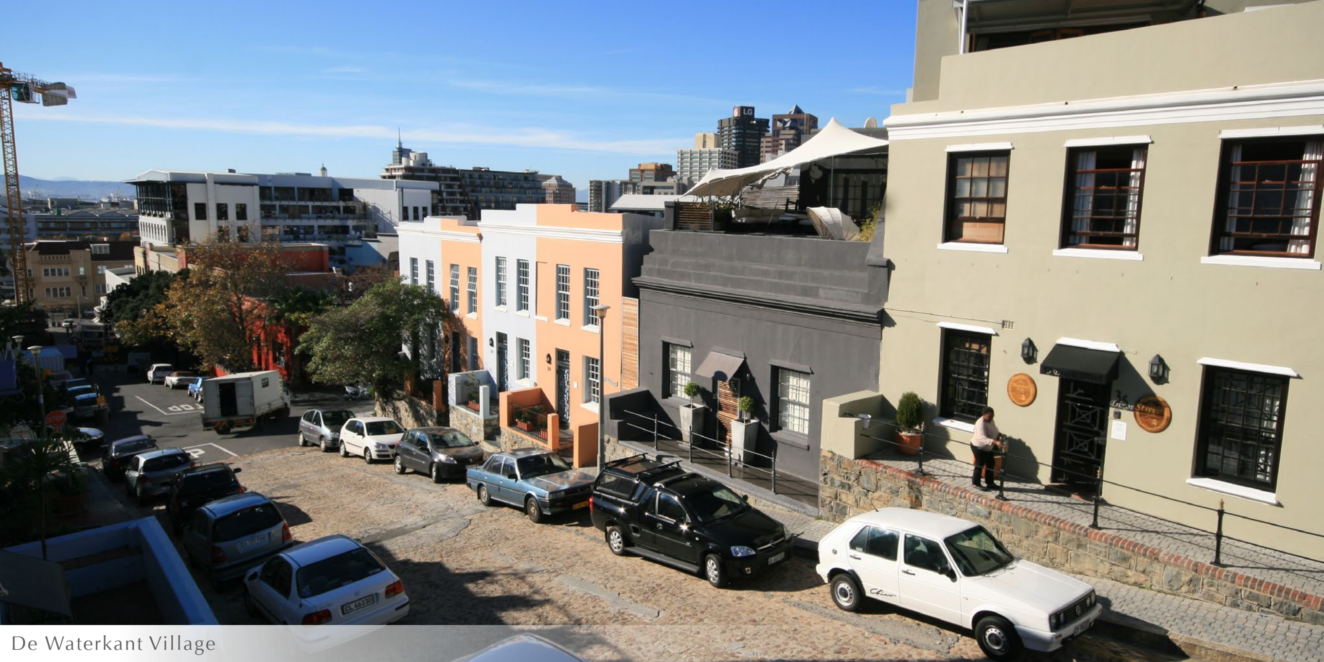
De Waterkant Village