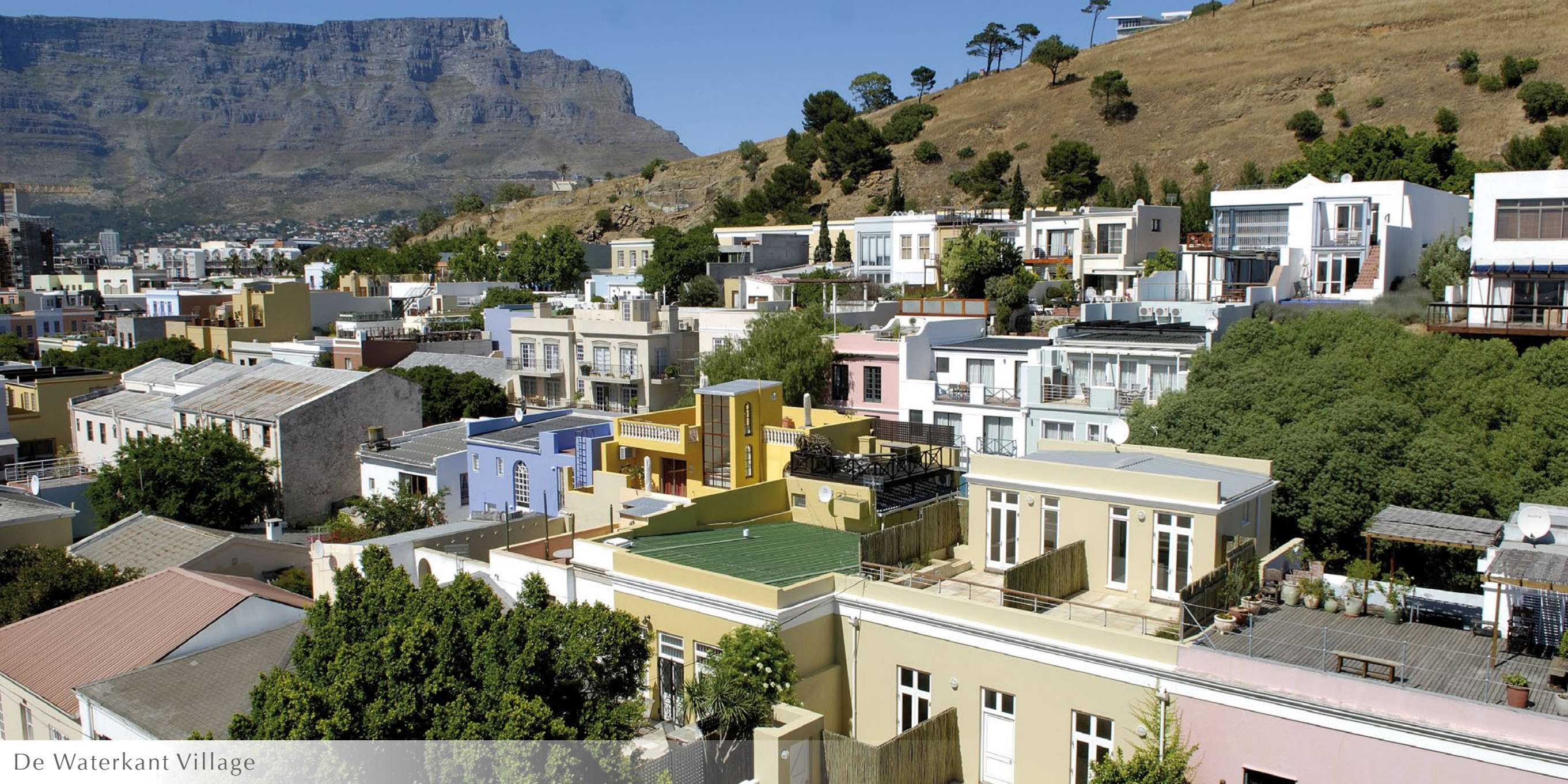
De Waterkant Village