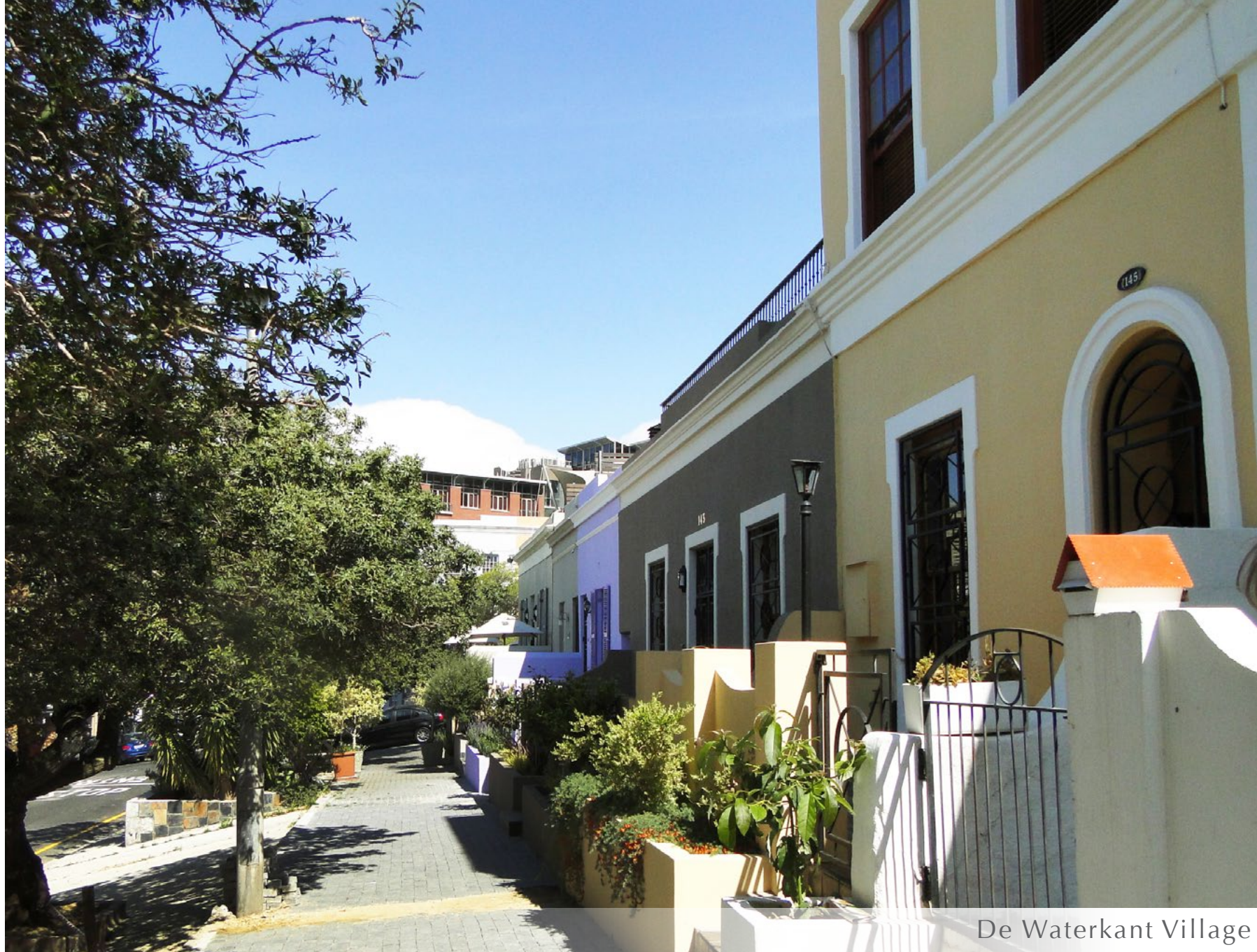
De Waterkant Village

Famed for being a gay friendly hub, the village is within walking distance of bars and fashionable nightspots. Drawing comparisons from cultural and artistic villages from all over the world, De Waterkant embraces individuality and theatricality, echoed in the architecture and vibrancy of its residents and visitors.