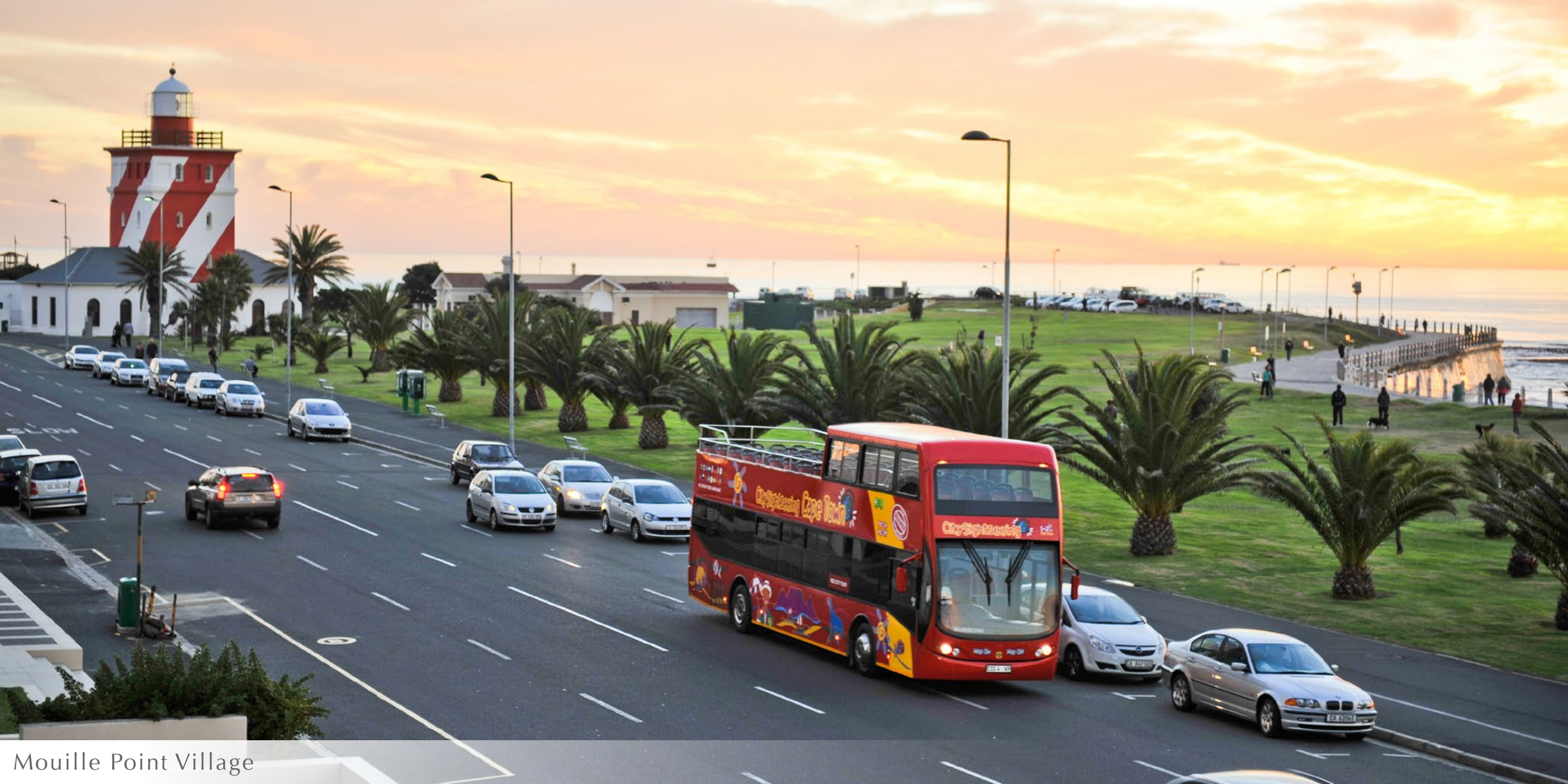
Mouille Point Village